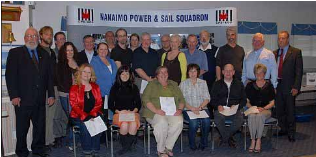
THE SPRING 2011 BOATING GRADUATES

All ladies are welcome—members or not. We would love to have some of the new members join us.